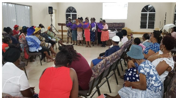
Women at bi-monthly Rally at Elim Chapel

Congratulations are due to the saints at Bethany Gospel Hall. This month, they celebrate 72 years of gospel witness and ministry in that area of the vineyard. To God be the glory!