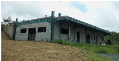
Sonrise Retreat Centre 2018

The way forward requires, but is not limited to detailed planning, funding, establishing legal and administrative