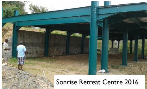
Sonrise Retreat Centre 2016

Both groups of campers were encouraged to leave their mark by engaging in tree-planting exercises (sour sop, and rough lemons) in their respective weeks.