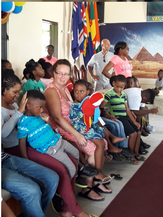
Left: Excitement in VBS at Bethany Gospel Hall

In August, over 100 children attended VBS at the Bethany Gospel Hall, Stoney Ground, Anguilla . About 25 workers, including some from New Jersey USA and from St. Thomas, BVI assisted in the effort to reach the children with the gospel. Their theme was "God Makes a Way" - The Story of Moses.