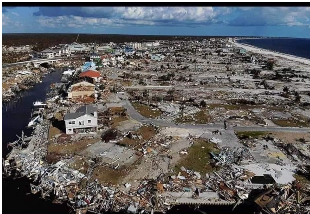
Just a glimpse of the devastation in the Bahamas caused Hurricane Dorian.