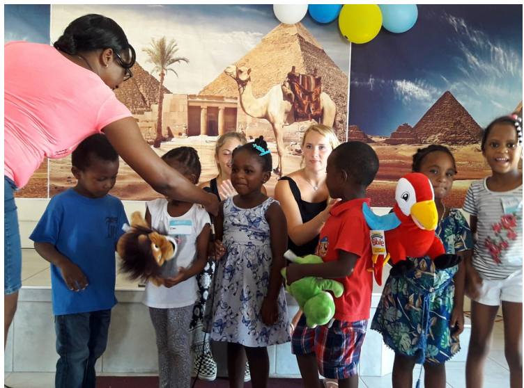
Below: Younger ones using puppets in their performance during VBS at Bethany Gospel Hall