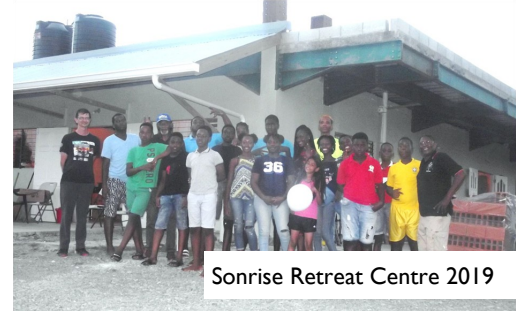
Sonrise Retreat Centre 2019

The attached photos serve to significantly tell our story of attainments with your help.