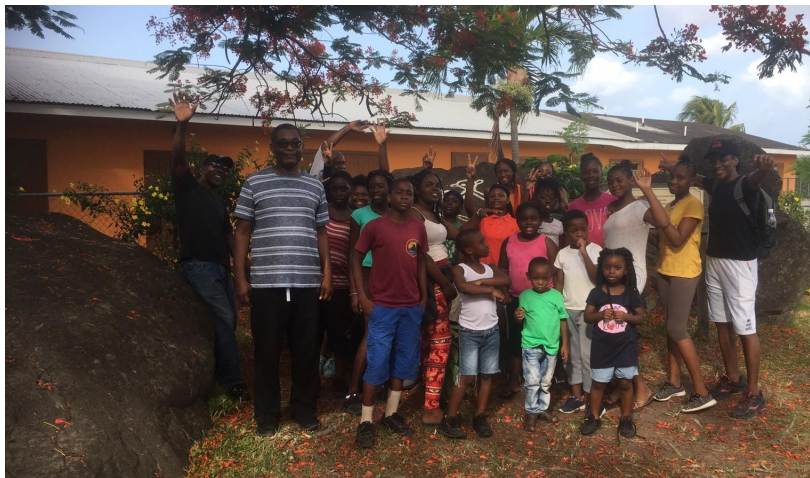
Left: "Children of the King" at Camp Abraham 2019 in St Kitts and Nevis.