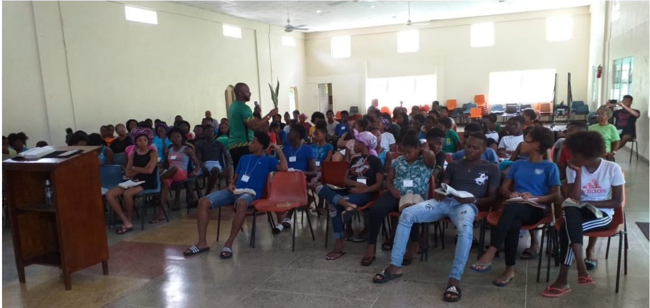
Above: Chapel in session at Camp in St Vincent. Contact: Tyrone Dickson.