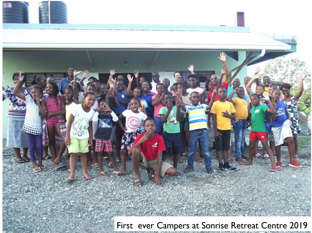
First ever Campers at Sonrise Retreat Centre 2019