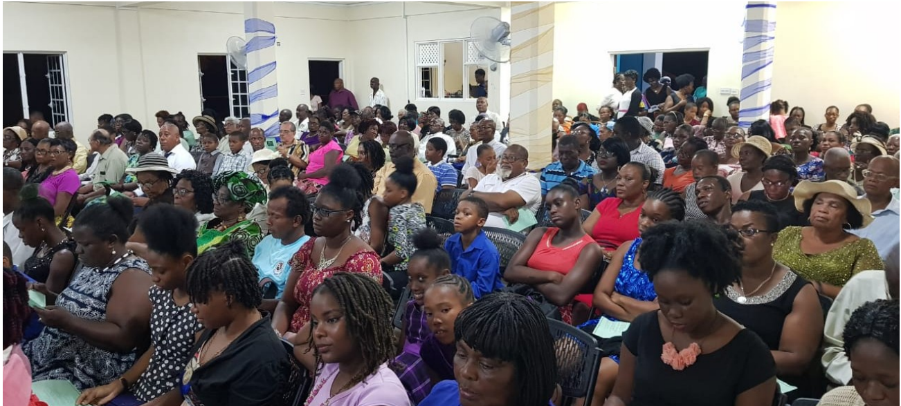
At Georgetown Gospel Hall: September 2019 A section of the congregation attending the service to dedicate the New Sanctuary

On Tuesday, September 24 th , 2019, a special service was held to dedicate the new sanctuary, marking the completion of the first phase of the Georgetown Gospel Hall Community Project. In a reversal of the trend in more developed countries, which involves the conversion of former church buildings into places of amusement, the brethren at Georgetown have acquired the former Lyric Cinema and are in the process of constructing a facility, which will house the main sanctuary, a preschool, an adult education centre, a multi-purpose hall, a library/internet café, a recording studio, and a gymnasium.