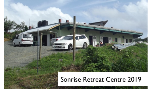
Sonrise Retreat Centre 2019

As we pursue this project to completion, we value your continued support in all areas and will keep you informed as we proceed.